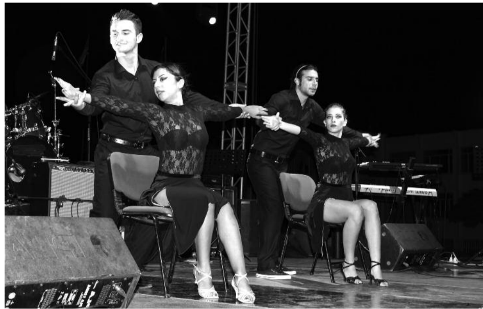
Members of the Dance Club celebrating Welcoming Night

riving students with an interesting show called "Flash Mob". The Flash mob had a group of students dressing up as clowns in very color full clothes. The event ended with "Manavella" and "Nafiz Dölek Band" concerts.