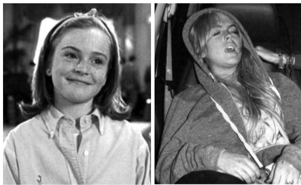
Lindsay Lohan before and after

Here are pictures of the actresses presented in this article when they started in Disney.