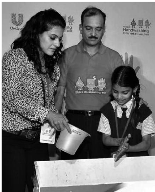
Washing hands can save a life

I believe this is an amazing cause, but before Lifebuoy uses “Help a child reach 5 “ for advertising purposes, people should wonder about the location of the 2million kids who die every year and then consider whether there is clean water first before choosing the soap they should use!