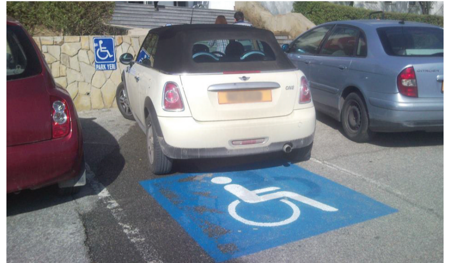
Car parking spaces reserved for disabled people are quite often occupied by the others

Let us imagine a student on a wheelchair who needs to enter the registration office or the rector office! Or imagine that person trying to reach a class in the second or third floor! Of course, people here are