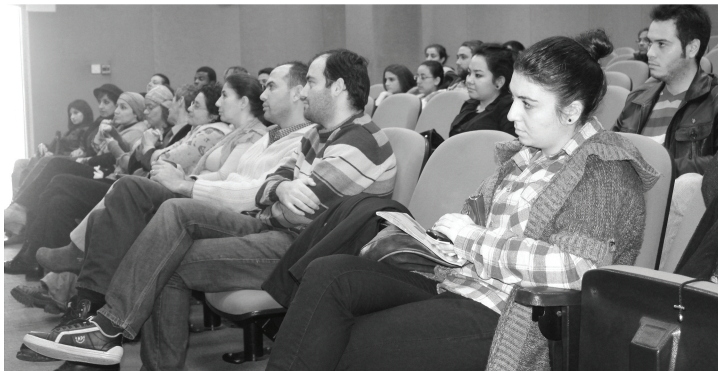
The Countrybook aims to provide students from different nationalities a communicative atmosphere