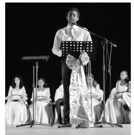
Christmas carols and Bible readings marked the celebration

alluring. Also hymns of Christmas epiphany, songs like joy to the world, ding dong merrily on high, choral works, and bible readings marked the celebration of the birth of Jesus, and the essence of Christmas celebrations.