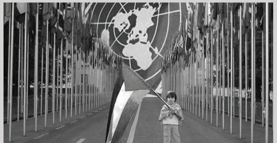
On 29 November 2012 Palestine was granted the status of non-member observer state in the United Nations

Palestinians are aware of the fact that such thing will not affect the Israelis much, but yet they are holding hope and trying to end this conflict with negotiations with the help of the international committee and according to the United Nations resolutions and agreements. And this victory as president Abbas described it will increase the possibility of achieving peace.