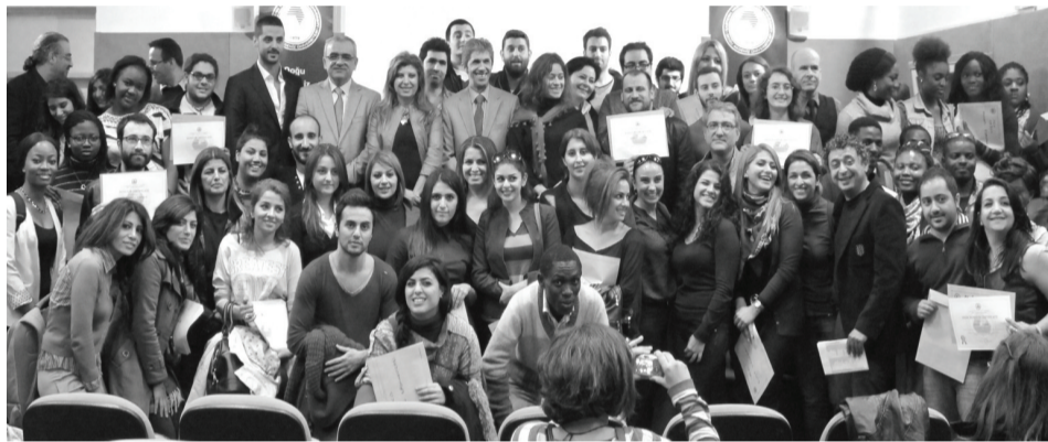
Sixty two students were awarded with honour or high honour certificates for their performance in the last Spring semester