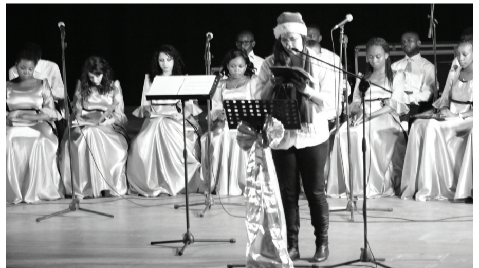
The Christmas celebration in Famagusta Cultural Centre on 21 December