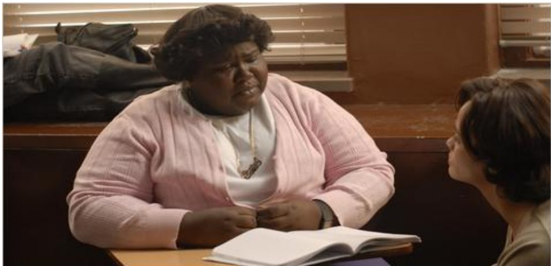
Figure 5: Precious crying out to Mrs. Rain that she lacks love and has AIDS