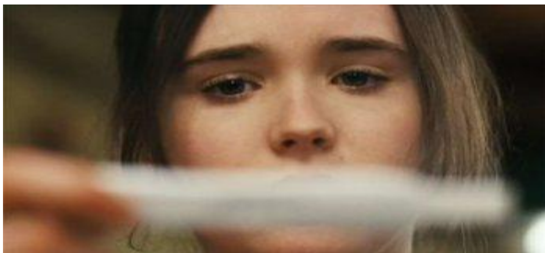
Figure 3: Juno checking results of her last pregnancy test

Juno is only 16 years old and it is normal that being pregnant frustrates her and changes her life for good. She takes many pregnancy tests to be sure she is pregnant because she didn't expect to get pregnant after having sex for the first time. She blames the chair for the problem she has and the problem she has here is being pregnant, something she never expected after having sex for the first time.