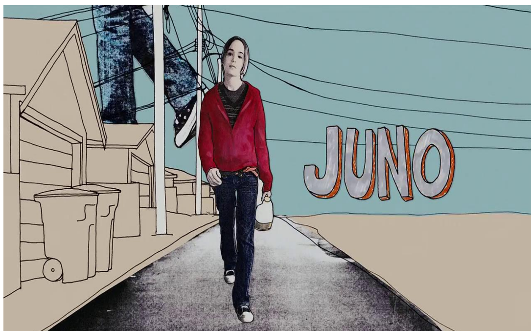
Figure 4: Juno drinking from a jug of orange juice out of frustration

HIV/AIDS, getting pregnant among others and also contraceptives if their children must have sex.