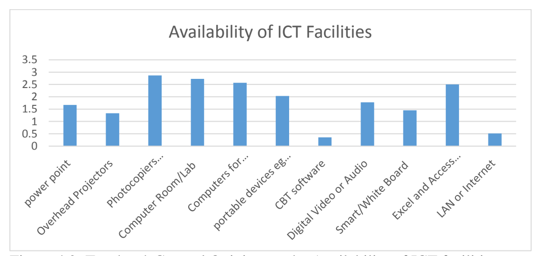
Figure 4.2: Teachers` General Opinion on the Availability of ICT facilities.

The Table above has an average mean value of 1.73. Values below and above are considered inadequate and available respectively. While values within the average are considered inadequate. It can be seen from the table according to teachers that ICT facilities that are readily available include Photocopiers Scanner and Printers (Mean = 2.87, SD = 0.70), Computer Rooms/Labs (Mean = 2.73, SD = 0.63), Computers for Research (Mean = 2.57, SD = 0.60) and Database software such as Access and Excel (Mean = 2.50, SD = .74). ICT facilities such as Presentation software such as power point, Personal Laptop and other digital mobile devices, Computer Based Test (CBT) software, and Digital Video or Audio inadequately available with the maximum mean value of 2.03. In the other hand, Overhead Projectors, Smart/White Board and LAN or Internet are virtually not available in all the schools. As can be seen in the figure below: