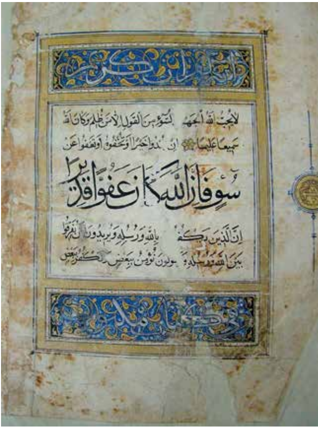
Fig. 5. Illuminated headings including verses of Vakîa Surah of a Qur'an Juz , dated 14th Century, Bursa Vakıflar Bölge Müdürlüğü, No. 1830, fol. 1b.