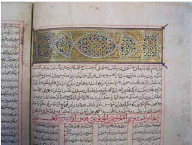
Fig. 8. Illuminated preface of the sixth chapter of Mathnawi al-Ma'nawi , 1330, Kyrenia National Archive, No. M.1006, fol. 96b.