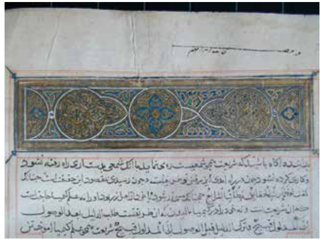
Fig. 6. Illuminated heading of the preface of the fifth chapter of Mathnawi al-Ma'nawi , 1320-21, Kyrenia National Archive, No. M.1006, fol. 44b.