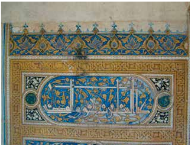
Fig. 3. Illuminated Frontispiece of eş-Şifa bi-Ta'rifi Hukukî'l-Mustafa , 1360, Tire Necip Paşa Library, Diğer Vakıf 562, fol. 2a (detail).