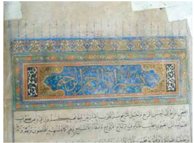
Fig. 2. Illuminated heading of the preface of the fourth chapter of Mathnawi al-Ma'nawi including “ Basmalah ”, 1327-28, Kyrenia National Archive, No. M.1006, fol. 1b.