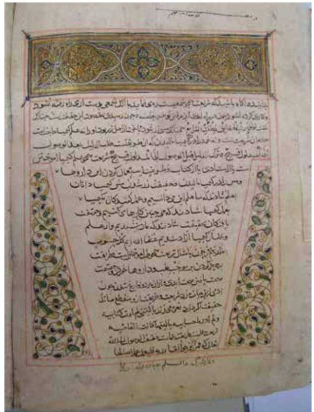
Fig. 7. Illuminated preface of the fifth chapter of Mathnawi al-Ma'nawi , 1320-21, Kyrenia National Archive, No. M.1006, fol. 44b.