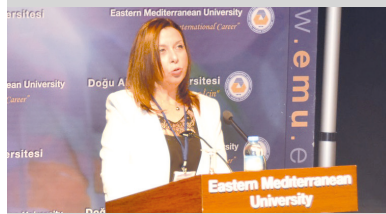
2 nd International Conference on Banking and Finance Perspectives Takes place at EMU