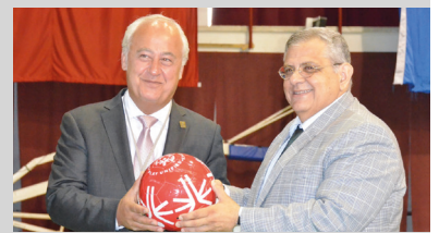
EMU Hosted Special Olympics Turkey Dilek Sabancı Mixed Football Project Activity