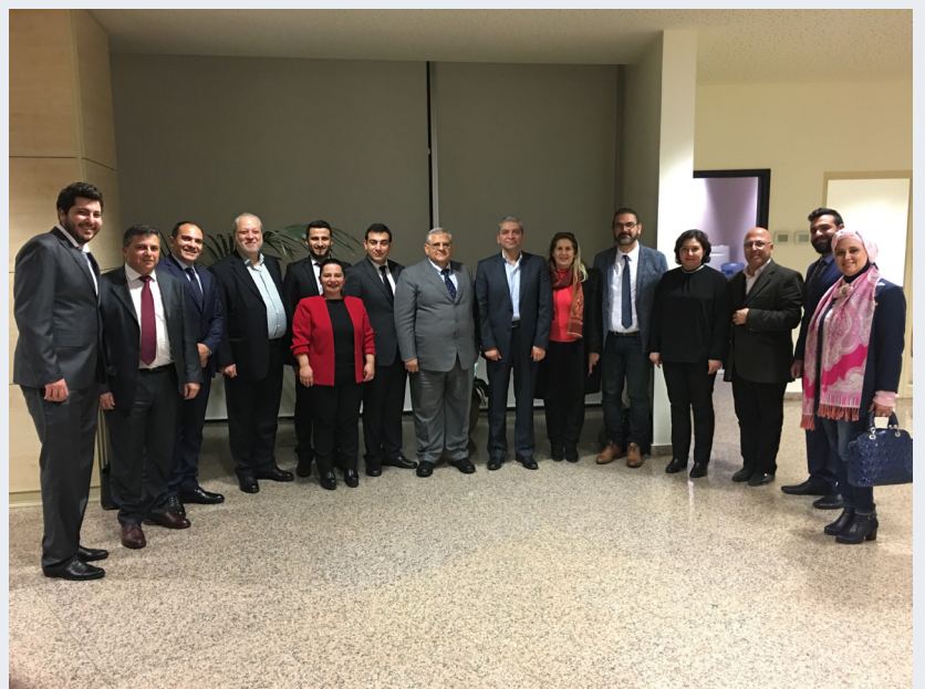
Alumni Meeting in Tripoli