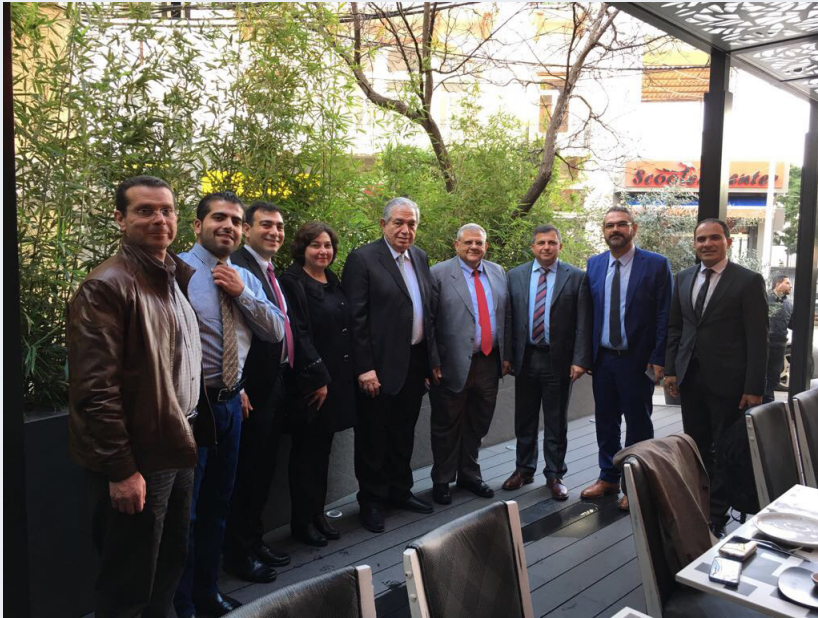
Former Northern Lebanon Education and Justice Minister, Future Movement Member of Parliament Samir Jisr