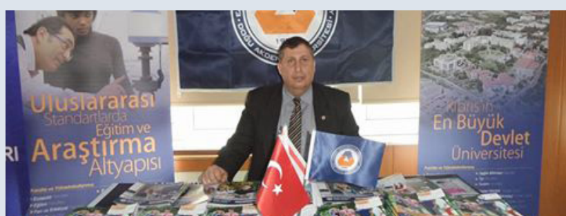
Our university was represented at the Private Ereğli Utku Anatolian and Science High School Promotion Days.