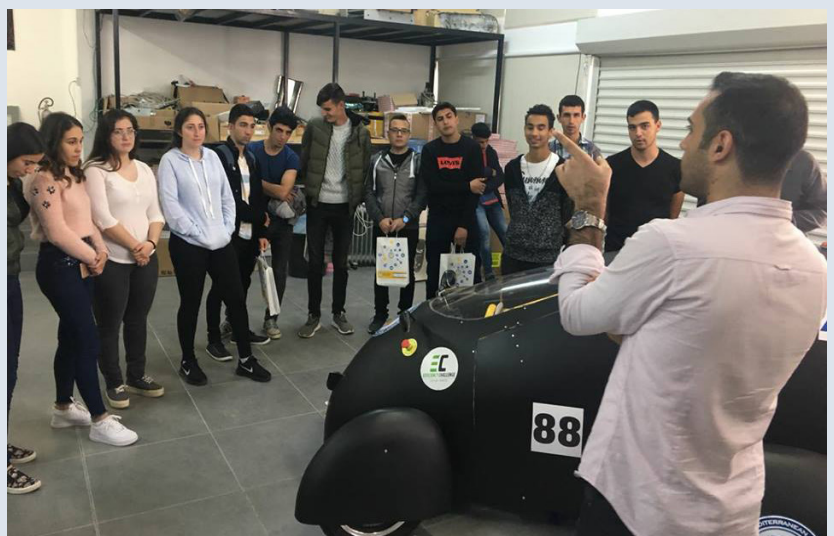
İskele Bekirpaşa High School students visiting our university faculty and departments on the 29th of March 2018.