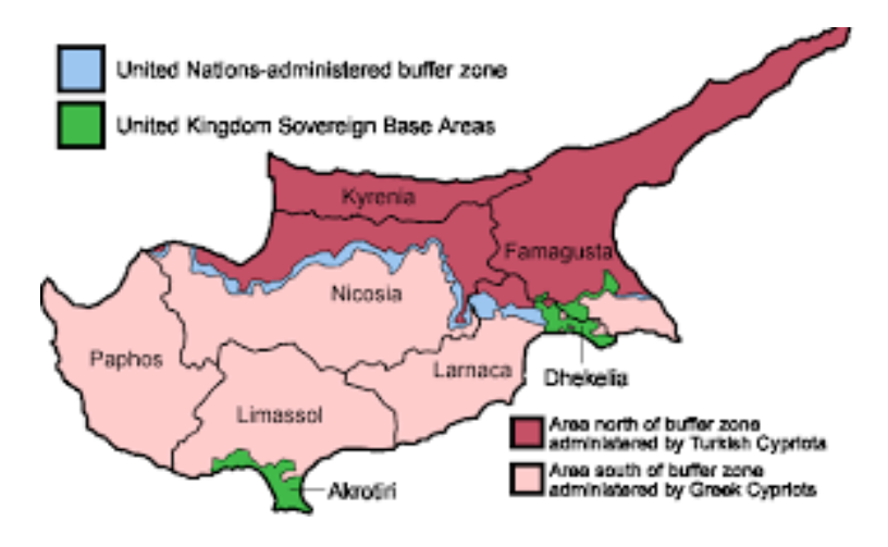
Figure 5: Map of Cyprus

The population of three main cities in TRNC is as follow: lefkosa, 85579, Famagusta, 64269, kyrenia, 62158 (TRNC State Planning Organization, 2012). After lefkosa, Famagusta is the biggest city in TRNC (TRNC 2006 Population and Dwelling). This city is located in the east part of the island. Famagusta has a rich history and there are many historical monuments and castles. North Cyprus's biggest university, Eastern Mediterranean University, is located in this city as well.