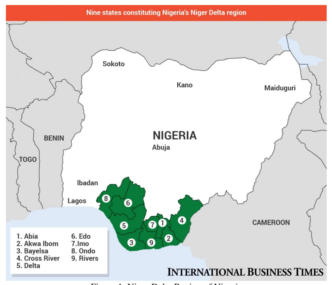
Figure 1: Niger Delta Region of Nigeria Source available at International Business Times, <a href="http://www.ibtimes.co.uk/nigerias-oil-war-who-are-niger-delta-militants-1520580">http://www.ibtimes.co.uk/nigerias-oil-war-who-are-niger-delta-militants-1520580</a>

"With the discovery of oil in 1956, the Niger Delta region, which hitherto was known for its agricultural export of palm oil, rose in significance in Nigeria's crude oil political economy with export earnings increasing from 1 per cent in 1958 to almost 98 per cent and about 90 per cent" (Oluwaniyi, 2010:310).