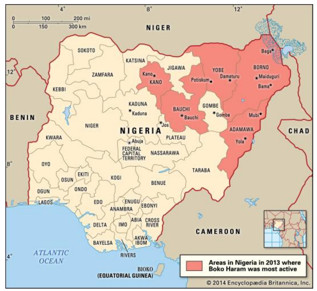
Figure 2. Areas in 2013 where Boko Haram was more active

Ethno-religious conflict, especially the case of Boko Haram often result to loss of life and displacement. In the case of Niger Delta militants, there are usually cases of death and other maltreatment that results when a hostage family members are unable to pay the ransom.