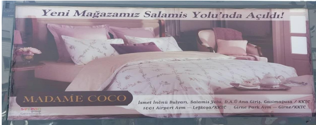
Figure 3 Billboards in Famagusta