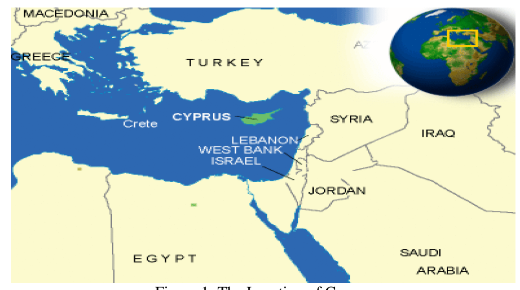
Figure 1: The Location of Cyprus