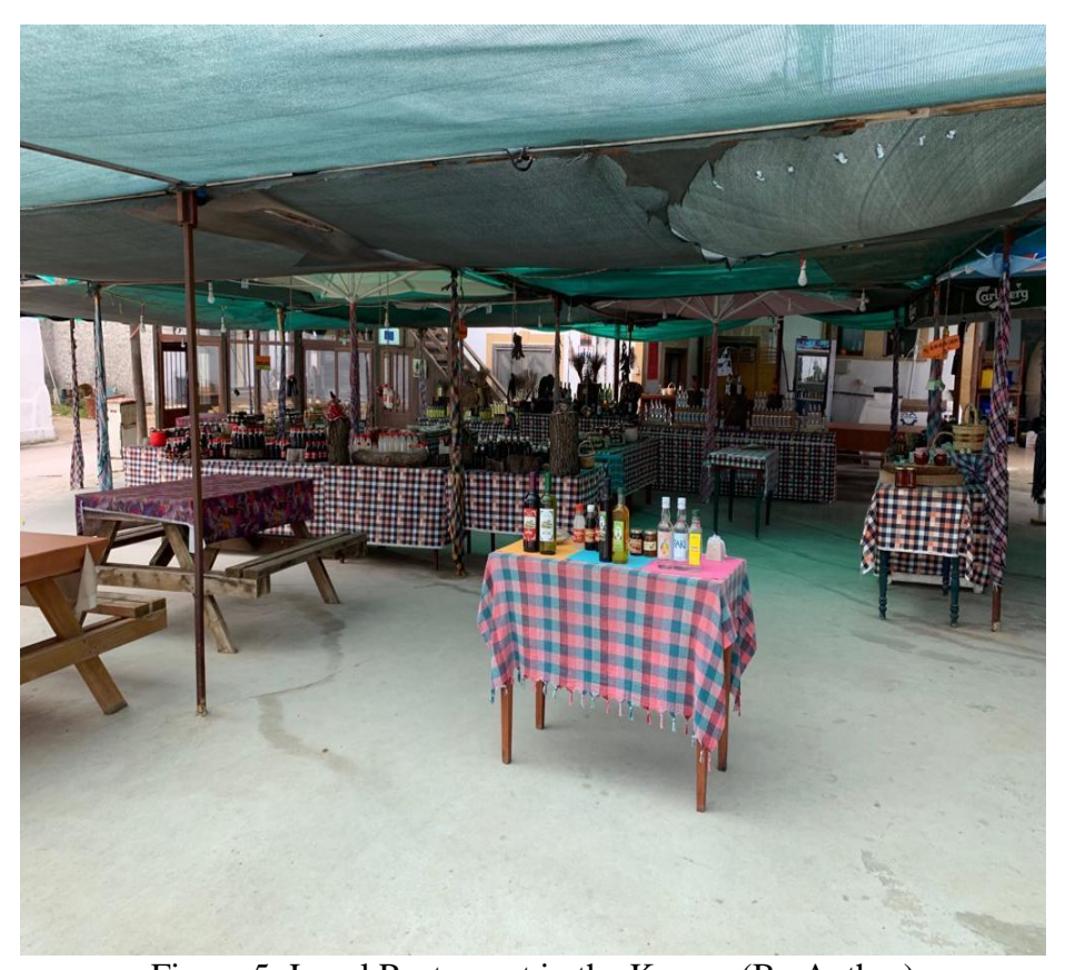
Figure 5: Local Restaurant in the Karpaz

Thus, the results show that the potential contribution of local people in tourism activities is increasing in Karpaz zone and rural women are seen as the greatest follower of this type of activities, it ultimately leads to self-development and their part. What distinguishes the Karpaz area from other touristic places in northern Cyprus is the role of rural women affectedly in order to contribute to tourism activities.