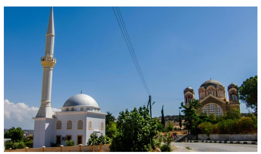
Figure 2: Karpaz and the Kantara Castle

modern classes, while food production, farming, and fishing are still basic resources of family income, however for further improvement they need extra assistance from the government on the way to foster their activities related to tourism involvement (Karpaz Peninsula, 2019; Gunsoy & Hannam, 2012; Depoele, 2010).