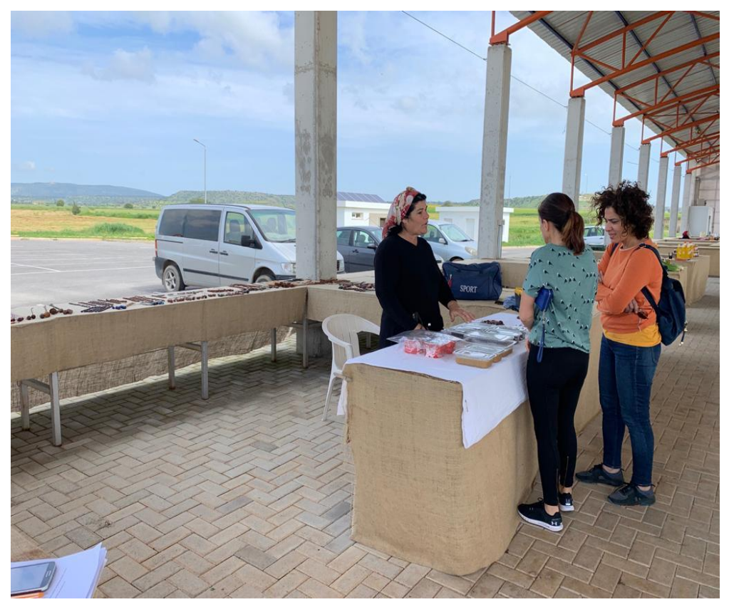
Figure 4: An Outdoor Market in Büyükkonuk, Karpaz

At the end of this section, it should be noted that the restaurant, some of whose staff and the owner was part of the contributors, was sponsored by the European Union financially.