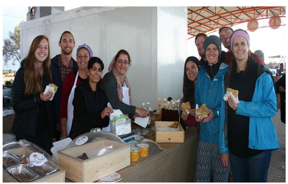
Figure 3: Women in Tourism Activities

economic situation, inequality employment and resource accessibility (Ampumuza, 2008; Anthias, 1989; Scott, 1997; Women in Cyprus, n.d.; Hadjipavlou, 2010).