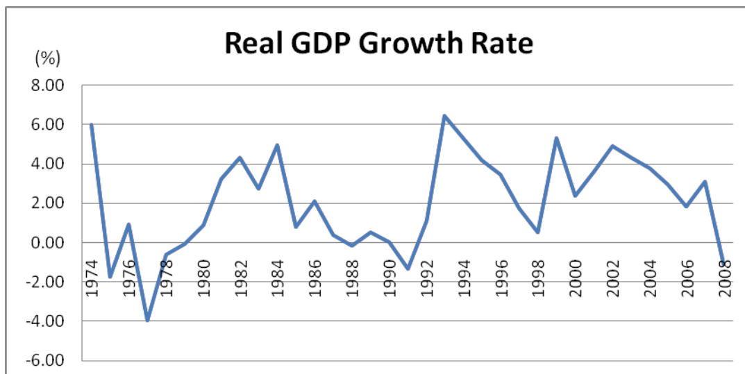
Figure 3.1: Growth Rate in Real Gross Domestic Product

The economy grew modestly in September 2009 when GDP increased by 0.2% due to improvement of primary production specially mining which covered declines in manufacturing and construction. International Monetary Fund (IMF) in its October 2009 World Economic Outlook, projected a growth of 2.2% in 2010 which increasing to 3.3% for 2014.