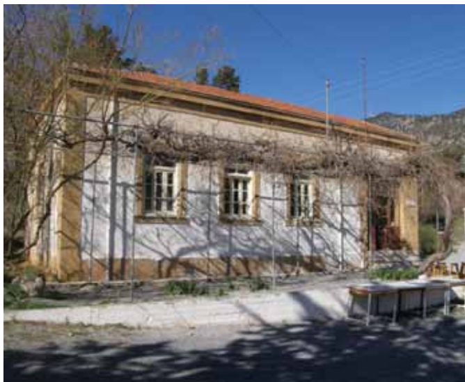
Akçiçek Village School