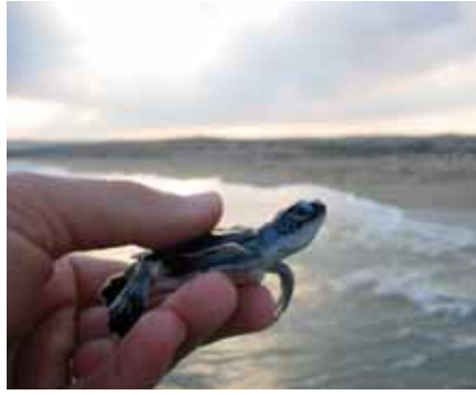
Figure 3: Newborn Chelonia mydas being released to the sea

Unique to our study is the newborn turtle analysis. After their release into the sea (Fig. 3), we monitored the newborns in the sea and gained valuable insight into their behavioral