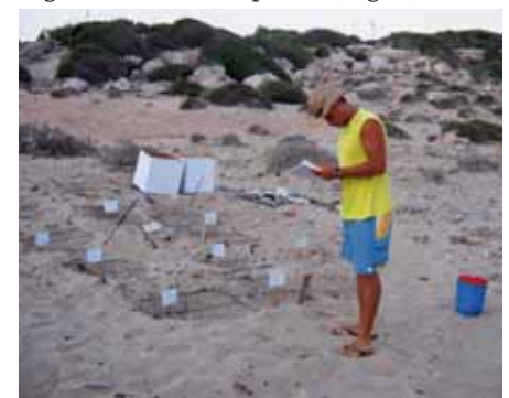
Figure 2: Protection of sea turtle nests

I was fortunate to have 25 students from EMU to volunteer. In addition, volunteers coming from several universities of England, Germany, Poland, Scotland, Turkey and United States took part in this project. During our field work, we have collected data on and facilitated protection of the existing nests for both species (Fig. 2).