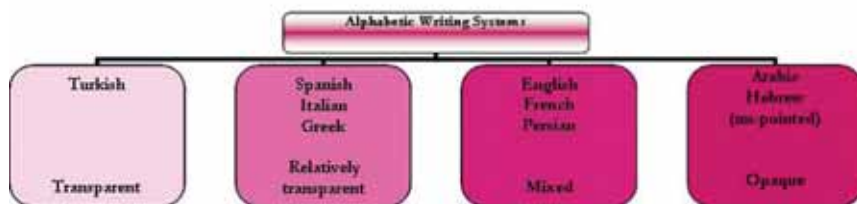
Figure 1: Orthographic transparency continuum based on mappings between print and sound in alphabetic writing systems (Raman, 1999)

An analysis of the spelling error data show that children educated in Turkey in their early years made more errors in French than Turkish [ t(13)=4.58, p<0.001 ]. Children who received their early education in France made three times more errors on average in Turkish than French [ t(13)=11.29, p<0.0001 ]. There was a significant difference between the two education groups on Turkish errors