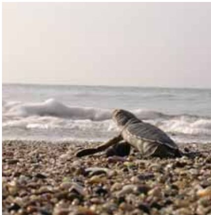
Figure 1: Newborn Caretta caretta on land in Karpaz shores

Today, all sea turtle species are faced with the threat of being eradicated from the oceans and shores of the Earth. On the shores of our country, there are two types of sea turtles; Chelonia mydas and Caretta caretta which are under the same threat (Fig. 1). Especially Chelonia mydas populations are reported to be below critical levels in the Mediterranean (Canbolat, 2004).