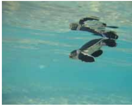
Figure 4: Newborn Chelonia mydas underwater

In order to be able to continue protecting the sea turtles, in addition to international agreements, there needs to be a continuum in the ecological and biological research and data collection. In parallel with the