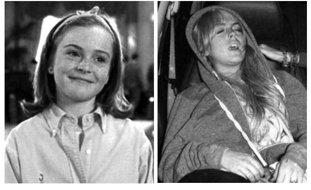
Lindsay Lohan before and after

Few Disney actors continue acting in Disney productions after they turn 18 – they usually build a career in a different entertainment industries because pursuing stud-