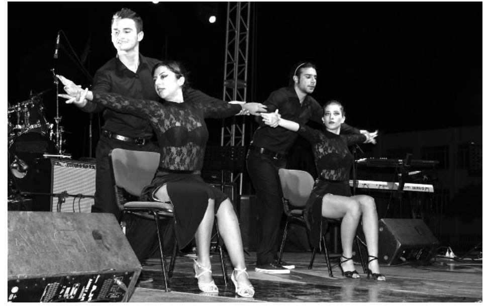
Members of the Dance Club celebrating Welcoming Night

riving students with an interesting show called "Flash Mob". The Flash mob had a group of students dressing up as clowns in very color full clothes. The event ended with "Manavella" and "Nafiz Dölek Band" concerts.