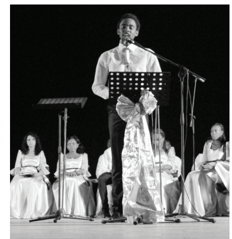
Christmas carols and Bible readings marked the celebration

alluring. Also hymns of Christmas epiphany, songs like joy to the world, ding dong merrily on high, choral works, and bible readings marked the celebration of the birth of Jesus, and the essence of Christmas celebrations.