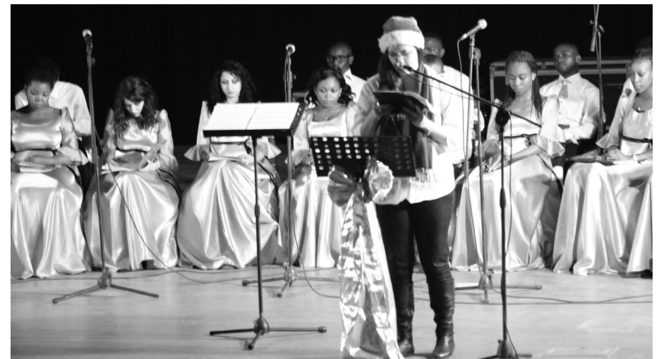
The Christmas celebration in Famagusta Cultural Centre on 21 December