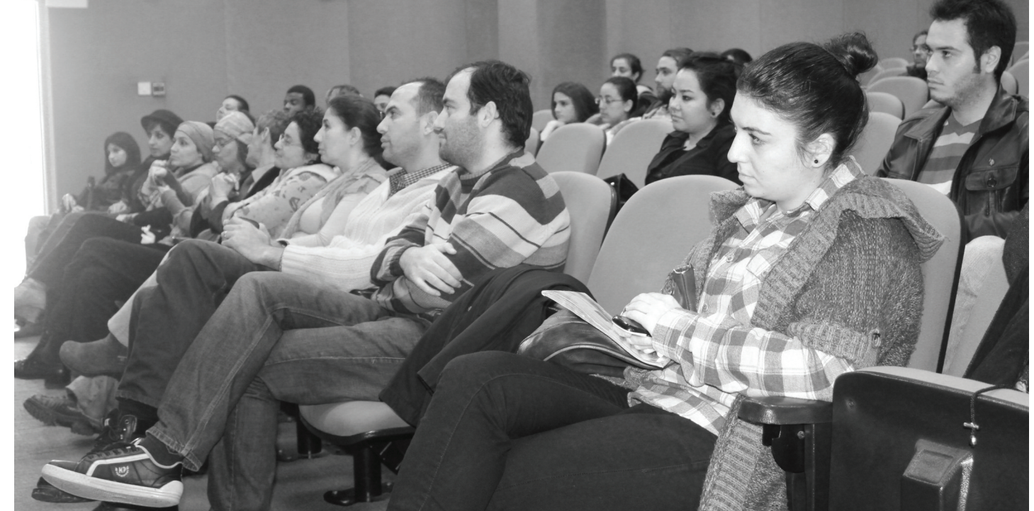
The Countrybook aims to provide students from different nationalities a communicative atmosphere