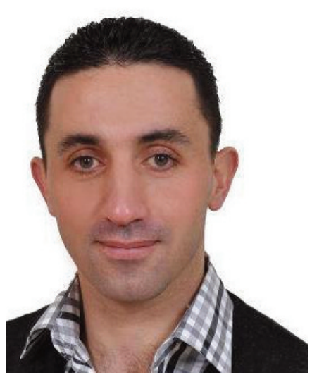
Mohammed was killed a few days after the interview