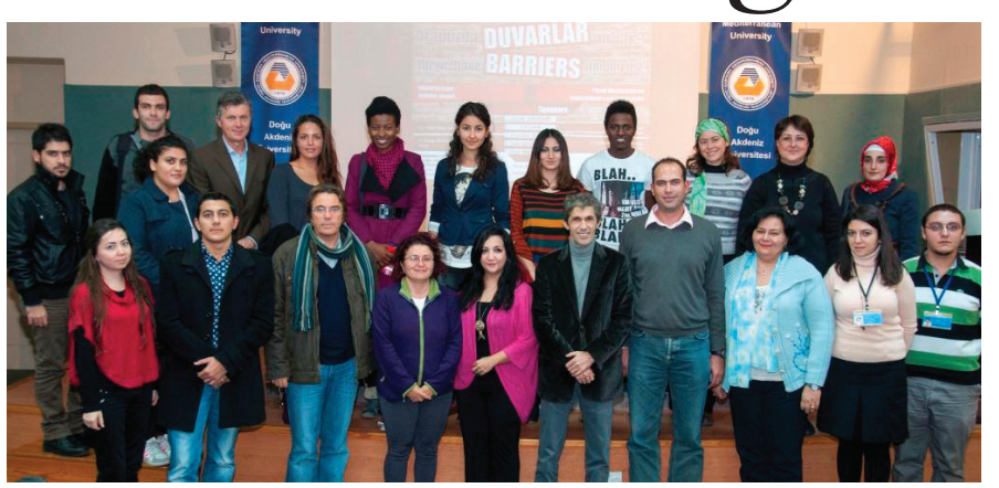
The panel discussion was organized by Gündem Newspaper and the Turkish Speaking Multicultural Club

Can was a Turk who grew up in Germany, and later lived in Australia. Seliz Bağcılar was a Turkish Cypriot