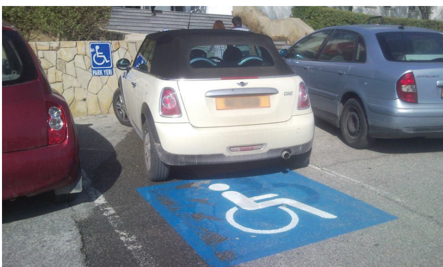
Car parking spaces reserved for disabled people are quite often occupied by the others

Let us imagine a student on a wheelchair who needs to enter the registration office or the rector office! Or imagine that person trying to reach a class in the second or third floor! Of course, people here are