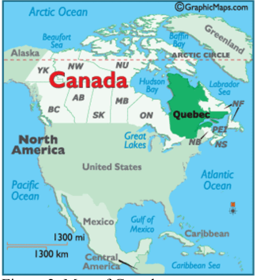
Figure 2: Map of Canada

Distribution of population of Canada is very disparate according to different aspects such as climate, economy and historical background. The major segment of Canadian inhabitant settled in Southern Ontario, Quebec and British Colombia provinces. has a very uneven distribution. Due to factors related to historical settlement. Since the North region is extremely cold less population has been settled in this region. (Ibid., 2013)