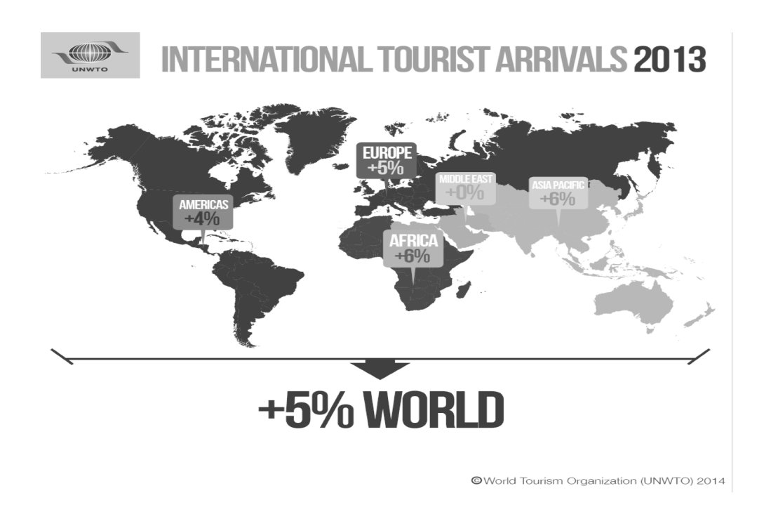
Figure 1: info-graphic of international tourist arrival 2013