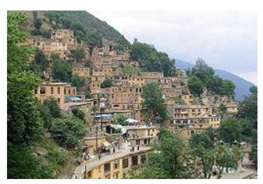
Figure 1.2: A view of Masoule in 2007