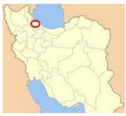
Figure 1.1: Masoule location on the map of Iran