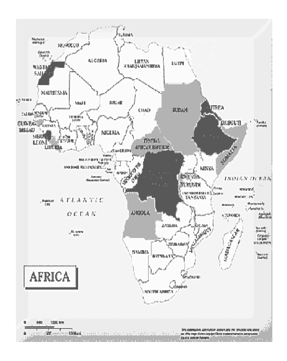
Figure 1: UN peacekeeping (dark) and peace building (lighter shade) missions in Africa. Map prepared by Peace & Security Section, UN Dept. of Public Information<sup>64</sup>

also introduced a new practice of not putting in that part of the Chapter VII mandate allowing the use of "all necessary measures". The Council thus reconciled with the Chapter VII provisions governing the use of force.