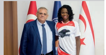
Champions Choose EMU