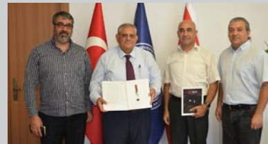
EMU Leading The Way With Secure Electronic Signatures