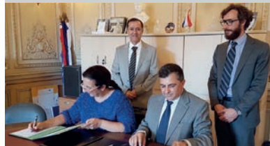
Eastern Mediterranean University Signs Collaboration Protocol with the University of Nice Sophia Antipolis