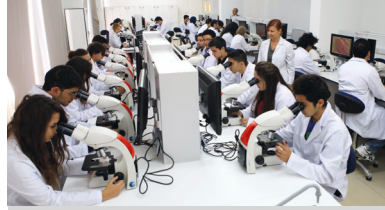
EMU Faculty of Medicine - Marmara University Faculty of Medicine Joint Program Makes it on to World Directory of Medical Schools p.8