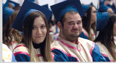
EMU Bids Farewell to 1399 Graduates p.12