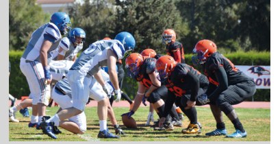
American Football Team EMU Crows Close To Second Place in Group p.23