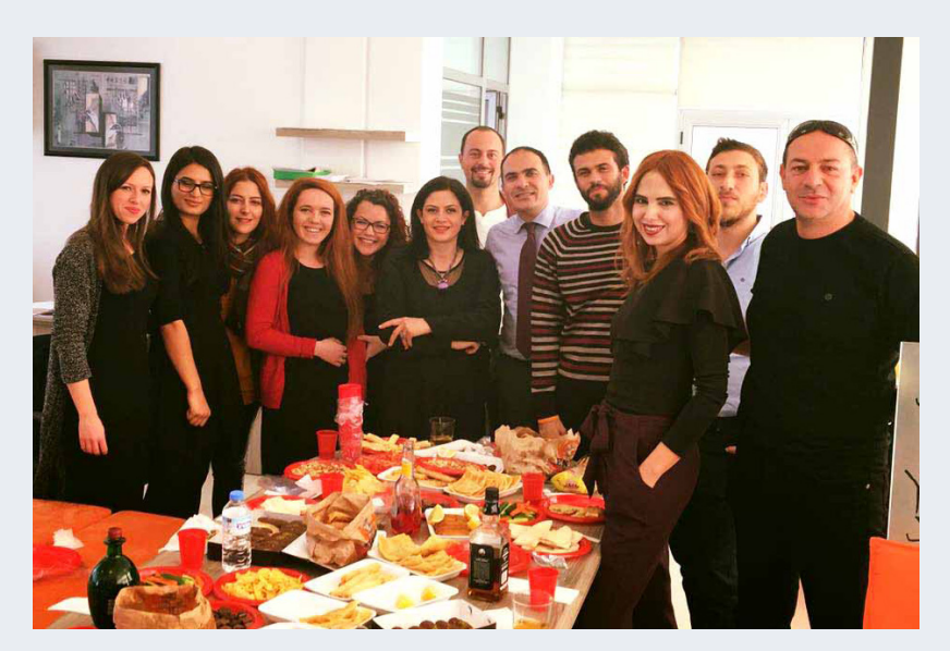
Public Relations and Press Directorate