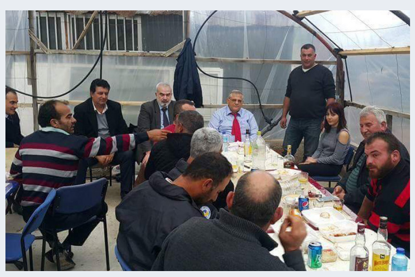
Environment Affairs Directorate