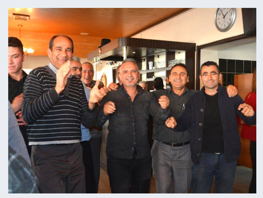
Purchasing and Inventory Control Directorate - Pressing Office