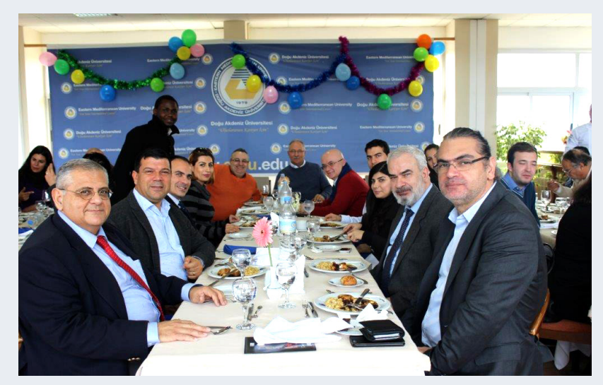
Faculty of Tourism