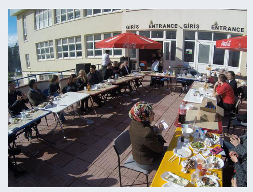
Sports Affairs Directorate