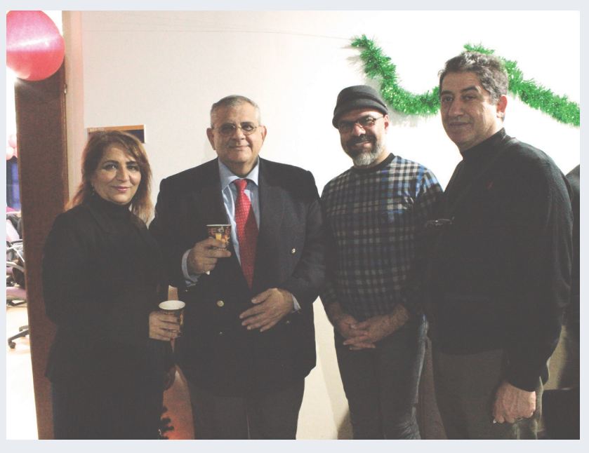
Faculty of Education