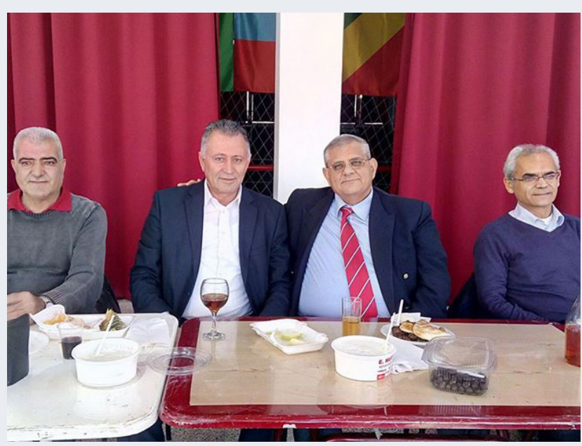
Sports Affairs Directorate