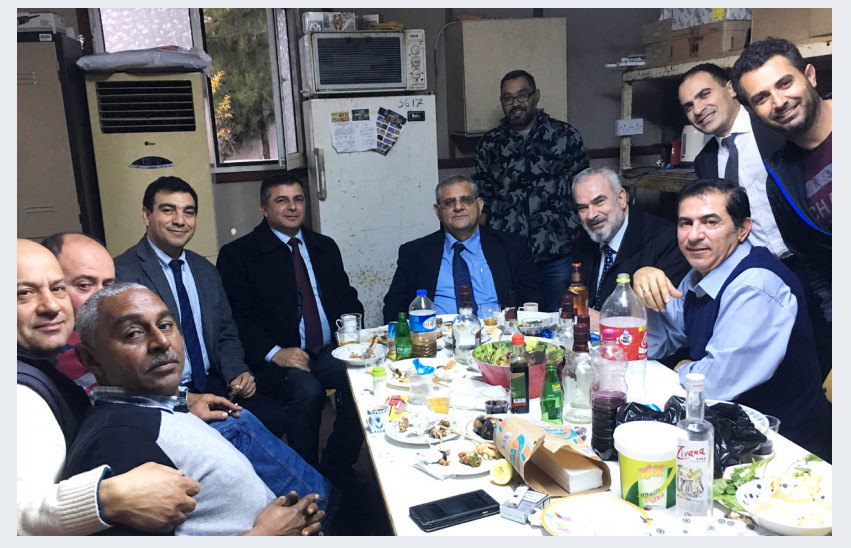
Technical Affairs Directorate