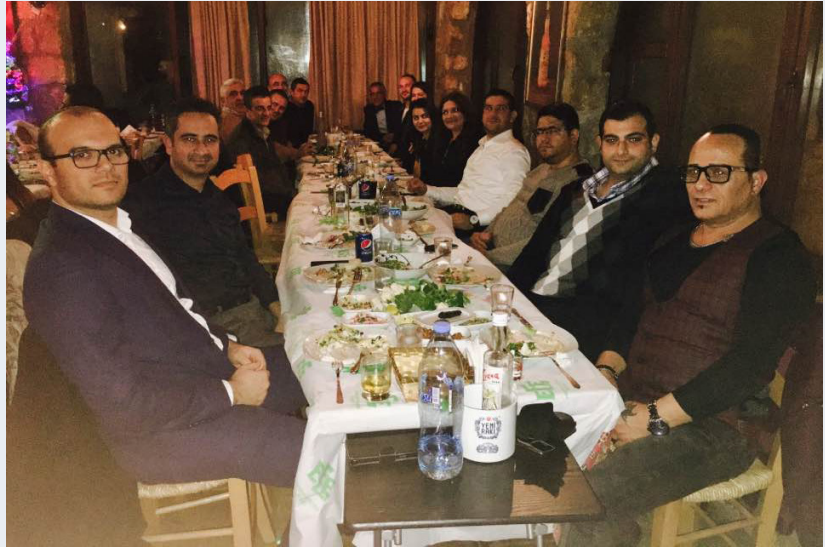
Computer Center Directorate