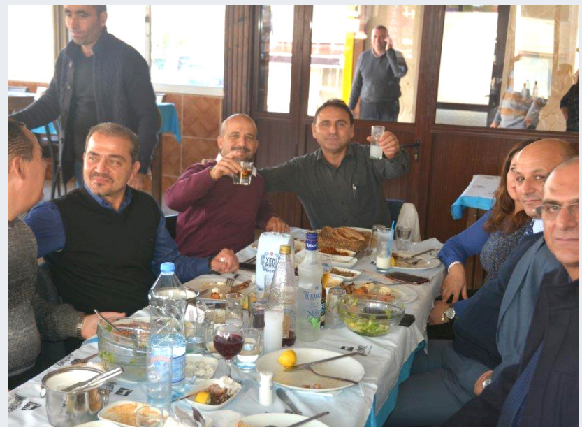
Purchasing and Inventory Control Directorate