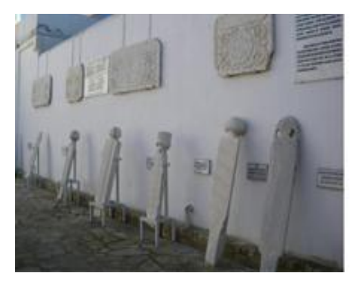
Figure 2: Mevlevi Tekke Museum

Nicosia that is the capital city of North Cyprus is the biggest and most populated city in North Cyprus. The city is a significant center of culture, business, diplomacy and arts. There are various visiting places in Nocosia. Some important places to visit are "Kyrenia gate", "Mevlevi Tekke Museum", "National Struggle Museum", and "Arab Ahmet Mosque" (North Cyprus Tourist Guide, 2010-2011: 43).