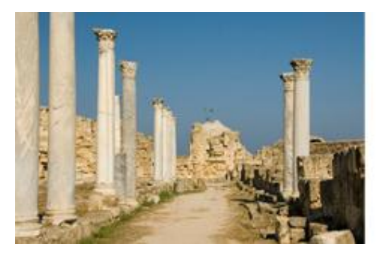
Figure 7: Salamis Ruins