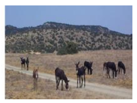
Figure 11: Karpaz Village