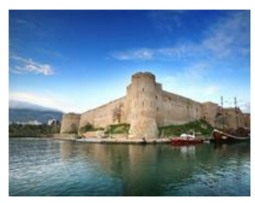
Figure 5: Kyrenia Castle