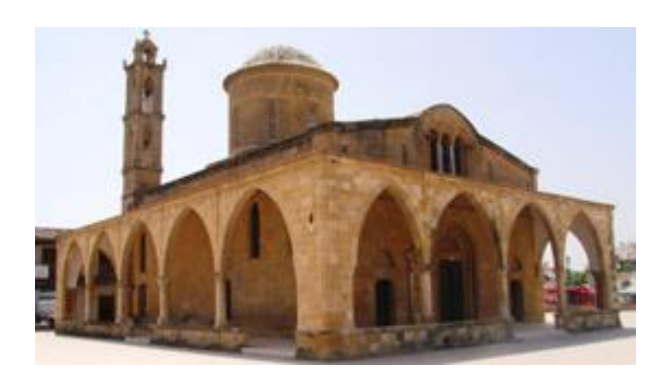
Figure 6: Pigades Temple

"The city Mrophou that is situated in the northwest of Cyprus is one of the richest agricultural areas in Cyprus, and it is well-known for famous particularly for the Citrus and strawberries. Spring is a great season to enjoy the nature of the city. There are some places in Morphou that deserve seeing such as Pigades Temple.