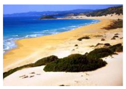
Figure 10: Golden Beach

"Karpaz" is located in north-east part of Cyprus. The beautiful beaches and wild life are important attraction for the city. During summer holiday, the city welcomes different tourists from various countries. They can enjoy the nature as well as nice weather during summer. One important tourists' destination is Golden Beach that is one of the most beautiful beaches in the world.