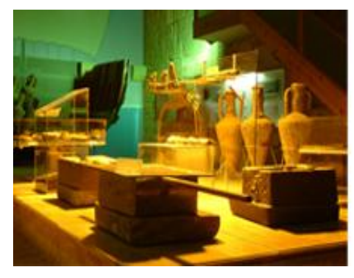
Figure 4: Shipwreck Museum

Some important places to visit in Kyrenia are Kyrenia Castle, shipwreck museum, Agha Cafer Pasha Mosque, museum of folk arts, and Saint Hilarion Castle.