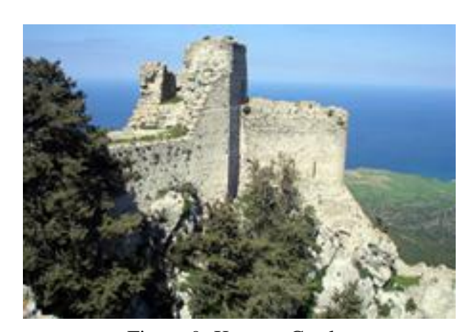
Figure 9: Kantara Castle

Passengers can pass through the village that is called "Yeni Iskele" on the return from Karpaz to Famagusta. It is an important touristic center where green meets blue on a 25-km-long coastline (North Cyprus Tourist Guide, 2010-2011). There are many hotels and seafood restaurants in the Boghaz region of Iskele. This region is known as an entertainment center. In the small harbor of Boghaz, the fishing boats offer the visitors cruises along the eastern coast of North Cyprus. The Bafra Beach area which was recently opened for tourism investments will boom as one of the major recreation spots of Mediterranean in the near future. The most interesting visiting place in Iskele is Kantara Castle.