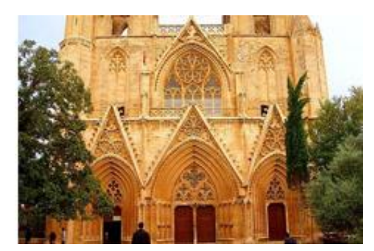
Figure 8: Lala Mustafa Pasha Mosque