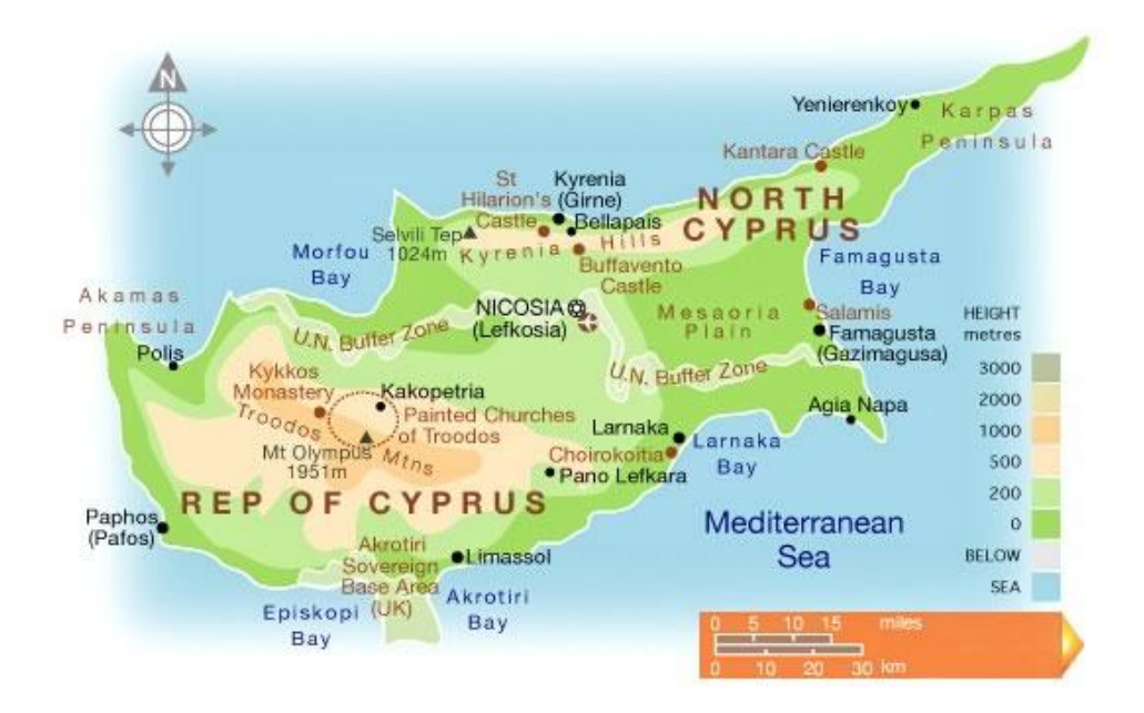
Figure 1: Cyprus Map