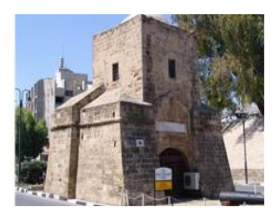
Figure 3: Kyrenia gate