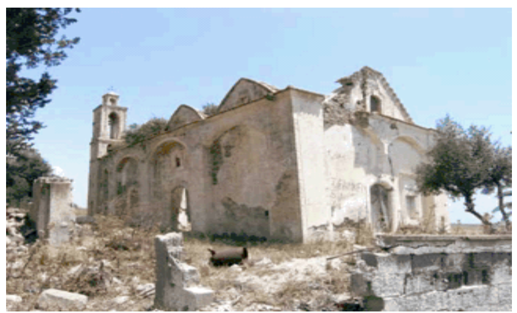
Figure 5: The Abandoned Church of Agia Aikaterini in Gerani