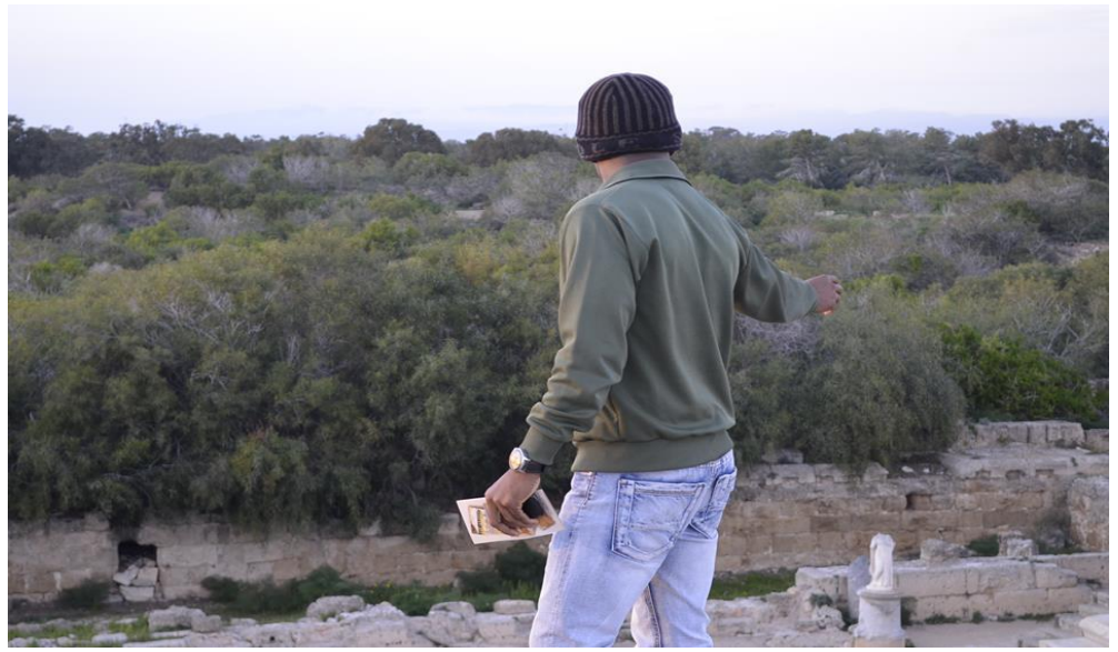
Figure 3: Human Settlement in Salamis left to fallow without conservation

development is just for the money it generates and the benefits goes to the tourism planners and partly government. "To make money" (Respondent 6)