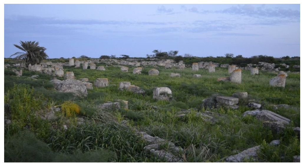
Figure 2: Cultural heritage monuments/relics of TRNC in a bad dilapidated state

...of course there are, most of the people that come here are not only for the beaches but to walk round heritage sites and there are tourists for cultural heritage product. Tourism companies need to see how they are to manage them since most of what they sell has to do with cultural sites...(Respondent 6)