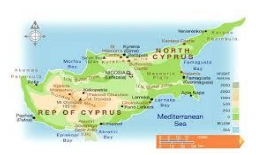
Figure 1: Map showing the demarcation of North Cyprus

Cyprus today is known to be the third biggest island around the Mediterranean. The ones larger that Cyprus are Sardinia and Sicily. Its location from Turkey's south-coast is about 65 km, Syria 97 km, Lebanon 108 km, 370 km to Egypt. The Northern Cypriots have lived separately from the Southern Cypriots as far back as 1974 after the conflict. The Northern part is politically controlled by the Turks and the Greeks control the Southern Cypriots. The land size of the Island is about 9,252 sq km with North Cyprus covering about 3,515 sq km (242 km in width and 64 in-depth at its extreme points) (North Cyprus Tourist Guide, 2016).