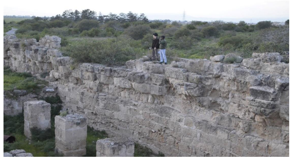
Figure 4: Famous Salamis Ruins in a deteriorating state

The citizens have no benefit in it as they are even denied a free use of the natural environment like the beaches because of tourism activities. The beaches are all covered with the umbrellas of tourism promoters during the summer and monetary charges are required both from tourists and citizens.