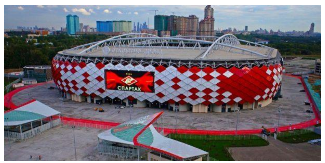
Figure 12: "Stadium Spartak" (Moscow)

carrying out the test match on the field, but the developer claims that the arena will be completely ready to host the Confederations Cup 2017. In addition, about the stadium in Saint-Petersburg it can be told, that this is the most expensive stadium in Europe and it will be equipped with many innovative technologies, one of which will include a new protection system against bad weather conditions (2017 February 13).