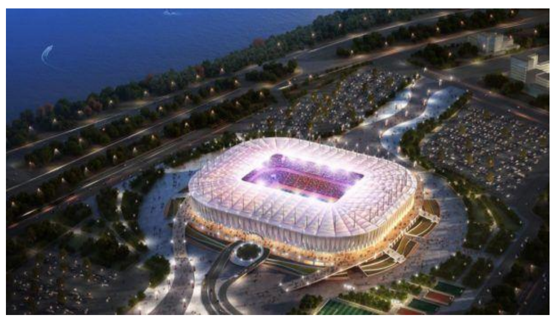
Figure 5: "Rostov Arena" (the city of Rostov-on-don): source:http://god-2018s.com/sport/stadiony-k-chempionatu-mira-po-futbolu-2018-goda-v-rossii.

"Rostov Arena" (the city of Rostov-on-don). Future stadium decided to build on the left Bank of the don. The construction cost of 20 billion rubles. Funds for construction are allocated from Federal and city budget. Compared to other Russian arenas, Rostov creation is characterized by an unusual architectural solution. North stand will be "open top" through which viewers will be available beautiful view of the don. Presented the project of the stadium was developed with all the requirements of FIFA—the safety here is at the highest level, special seats for persons with disabilities, as well as space for media and VIP stands. On the Theatre square of Rostov-na-Donu will have huge displays to the audience who have not managed to get to the stadium, had the opportunity to see the championship game. "Rostov-Arena" is close to complete the installation of the first layer of a football field. Work is performed 90%. Also, today 95% of works on construction of reinforced concrete stair, at 92% installation brick walls, 85% masonry for external walls and walls and 62% of completed works on installation of modular components of the deck stands. The front area is equipped with