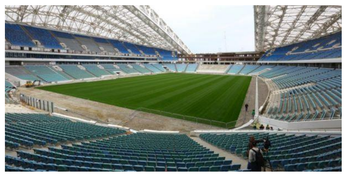
Figure 6: The "Fisht" Olympic Stadium (Sochi)

The "Fisht" Olympic stadium (Sochi). Bright the arena was built specifically for the Olympic winter games in 2014 in Sochi. "Fisht" placed in the Olympic Park of Adler. Today the arena is on the stage of completion: all construction works have been