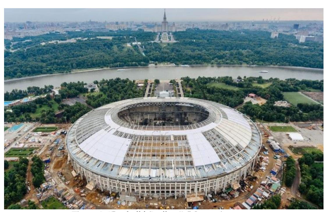
Figure 1: "Luzhniki Stadium" (Moscow)

In all the cities held large-scale works priced FIFA for the five main positions: training grounds, stadiums, hotels, FIFA, hotels for teams and airports. Most problems in these cities are observed from stadiums and international airports. All these issues were resolved in Sochi because of Olympic games in 2014, and in Kazan was conducted by the XXVII world summer Universiade in 2013, and are least represented in Moscow and Saint - Petersburg but in other cities was conducted and substantial work to achieve the estimated position of FIFA.