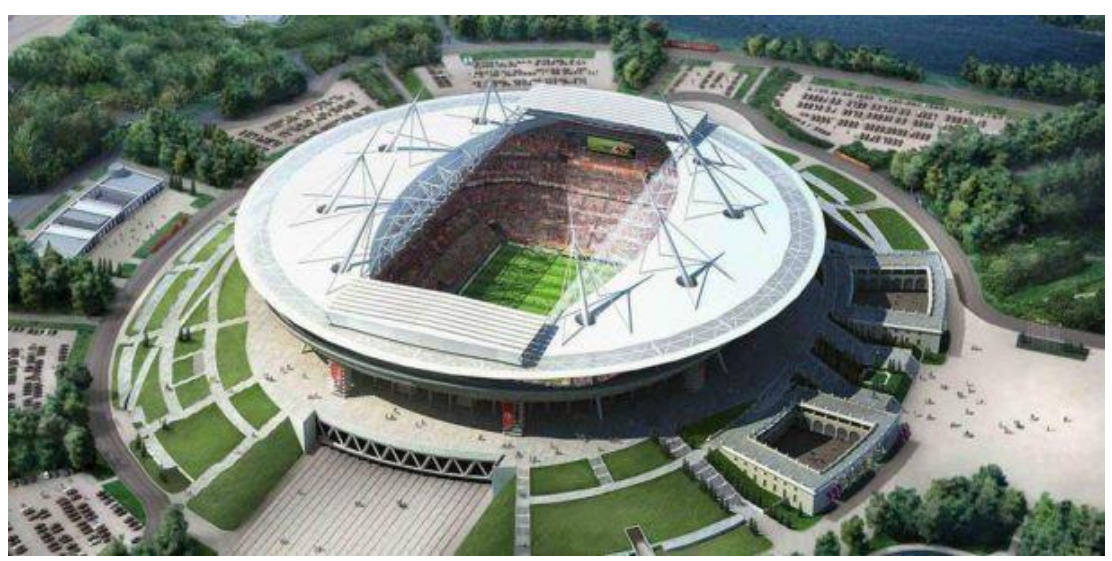
Figure 11: "Zenit arena" (Saint-Petersburg): source: http://god-2018s.com/sport/stadiony-k-chempionatu-mira-po-futbolu-2018-goda-v-rossii.

East – red, West – green. Spectator stands are closed canopy original blue color, while the field itself remains open. Under the stands are multifunctional facilities: medical facilities, Spa, fitness center, large hall with pool, entertainment and shopping establishments (restaurants, cafeterias, Museum of football team "Rubin", the Museum of retro-cars). The surrounding stadium area will have a Park and sports area. The creators are positioning this complex, with the adjacent territory, as a "city within a city" (2017 February 13).