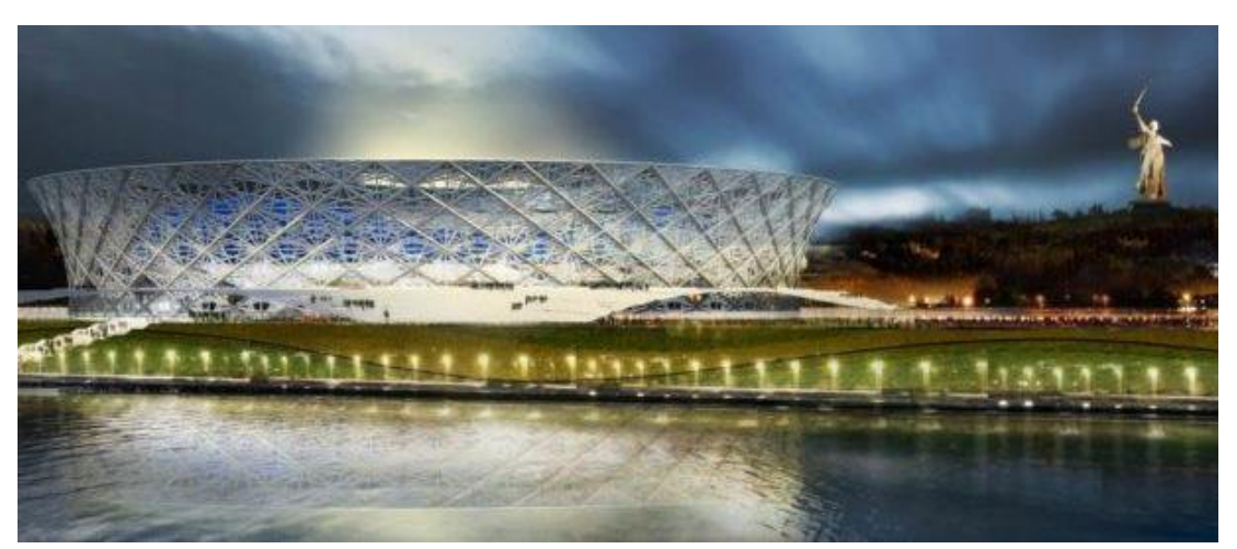
Figure 2: "The Stadium Pobeda" (Volgograd City): source: http://god-2018s.com/sport/stadiony-k-chempionatu-mira-po-futbolu-2018-goda-v-rossii.

Stadium "Luzhniki" (Moscow) the famous arena in 2013 was closed to conduct renovation work for the upcoming world championship. The main ceremony, the opening match of the championship, one semi-final meeting, and final contest will be held in this stadium. To fully comply with all the requirements of FIFA, the complex management considered the version of the demolition and construction of a new Large sports complex. In this scenario, the arena would be able to accommodate 90 000 people, and its total area amounted to 221 000 sq. m. But ultimately the management team of complex decided that it is better to perform reconstruction of the object than to demolish and then to build an arena from scratch (2017 February 13).