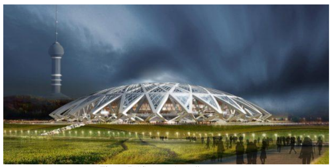
Figure 7: "Samara Arena": source: http://god-2018s.com/sport/stadiony-k-chempionatu-mira-po-futbolu-2018-goda-v-rossii.

Kazan, St. Petersburg and one of the Moscow football grounds will host the meetings of the confederations Cup 2017 (2017 February 13).