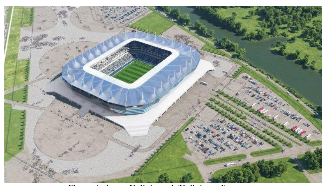
Figure 4: Arena Kaliningrad (Kaliningrad): source: http://god-2018s.com/sport/stadiony-k-chempionatu-mira-po-futbolu-2018-goda-v-rossii.

Cathedral. Thanks to this location, the new arena will meet and be a great continuation of the local appearance of the historical buildings. The area of the "Arrows" plan to unite into a recreational area for local residents and guests of Nizhny Novgorod, equipping the territory of the pedestrian walkways. The arena will have a capacity of 45 000 seats. For the construction of the facility will spend about 17 billion rubles. Today, the monolithic works are fully completed, the roof is also almost finished. In addition, the most important stage of the construction is almost finished — was erected last 88-th column. In addition, arena will receive transportation. In early 2012 the idea was proposed about creation on the territory of Strelka metro station, thanks to an extension of Sormovskaya line 1 station from the station by the beginning of 2018. At the end of the football world Cup, Nizhny Novgorod arena will be used for home games of the local football team "Volga" (2017 February 13).