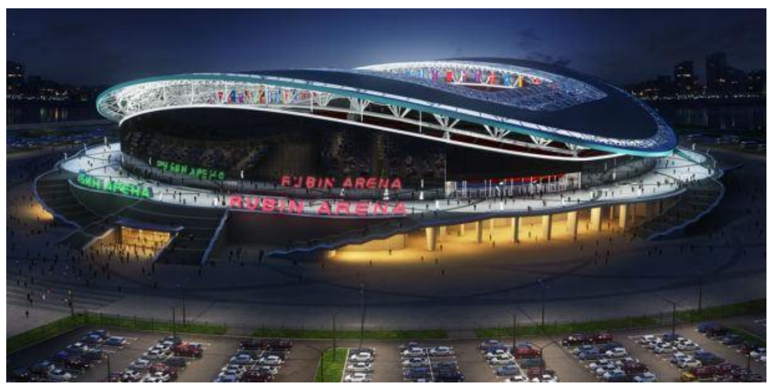
Figure 10: "Kazan Arena": source: http://god-2018s.com/sport/stadiony-k-chempionatu-mira-po-futbolu-2018-goda-v-rossii.

modernization of the "Central" was performed on 50%. To date, fully completed stage of concreting the base of the stands. Happen finishing work. With the onset of the spring season in the arena will occur in the treasure of the lawn. At the completion of the competition, the stadium will return the historical name of "Central" and will use it as a multifunctional urban entertainment-sports complex. In the future, it will be city events, sports tournaments at various levels, exhibitions, concerts (2017 February 13).