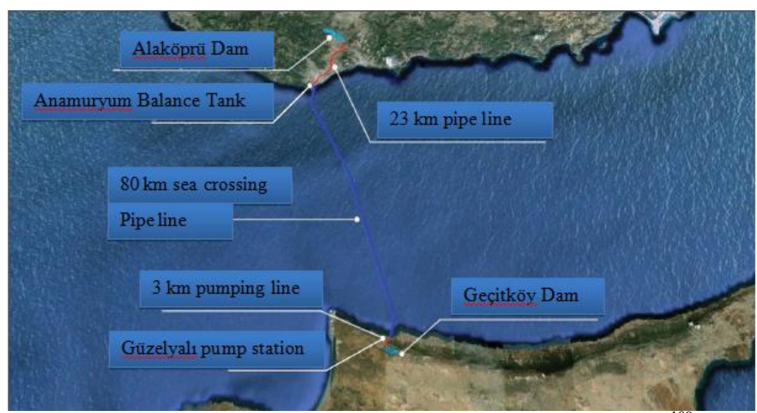
Figure 3.2: Map plan of the Northern Cyprus pipeline water transfer project <sup>109</sup>.

transferred water. Gecitkoy Dam has been started to be built on 2 April 2012. <sup>107</sup> The project is the most important pillar "Sea Crossing" unit will be applied for the first time in the world. British Neptune Oceanographics, Aquatec Group Limited and Trevor Jee Assocciates under the auspices ARTI Project Company have the control of Smartpipe System which will detect leaks and spills. <sup>108</sup>