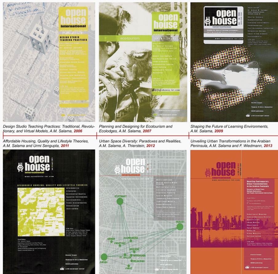
Figure 1. OHI – covers of special issues identified to capture the leitmotif narrative