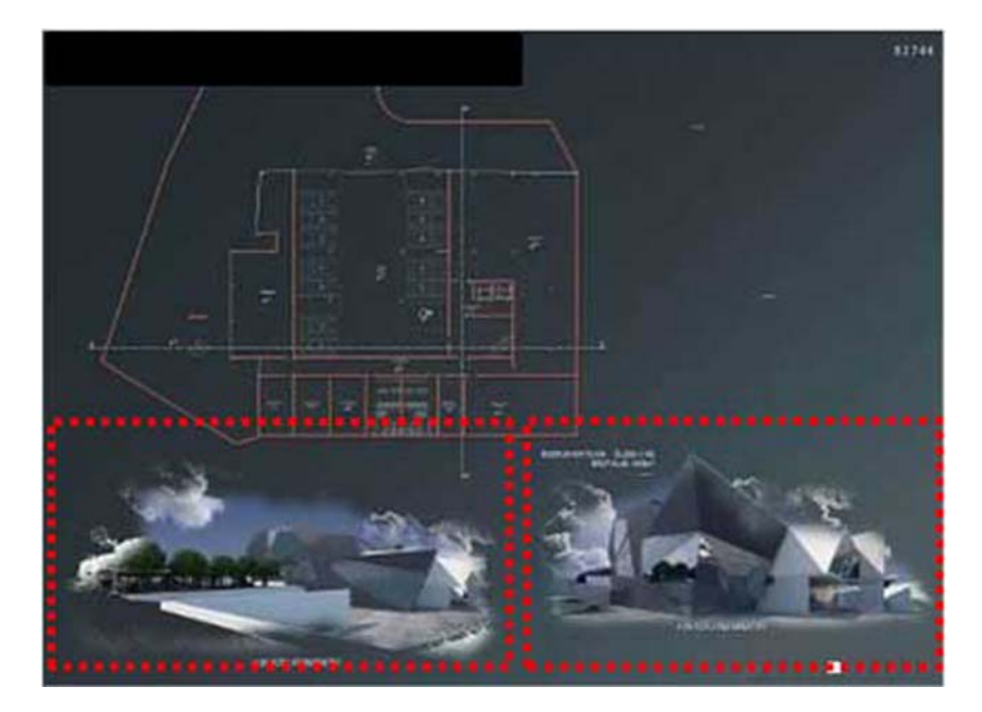
Figure 8. Sample of the M1.