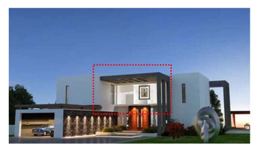
Figure 6. Sample of the K1 (http://mehmeteminogluinvestment.com/bella-proje.html, 2018).

Two types of such problems were identified: opacity and brightness (luminosity) (K1). During the research, they were studied together because of their similarity. The representative sample for K-type problems was the K1 type.