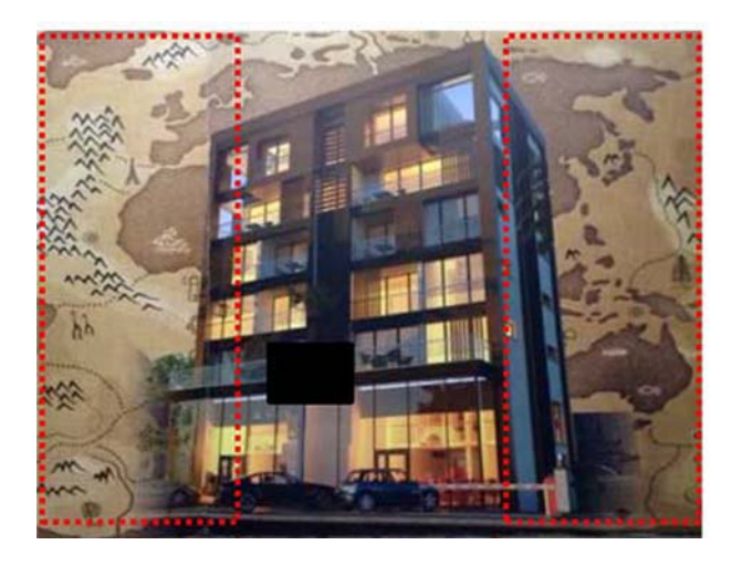
Figure 4. Sample of I1 (E4 sale catalogue, 2017).