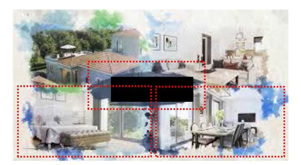
Figure 1. Sample of F6 (http://mehmeteminogluinvestment.com/bella-proje.html, 2018).