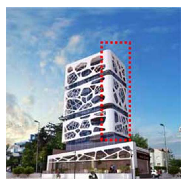
Figure 5. Sample of the J1 (https://www.kibrisemlakmerkezi.com/kibris-konut-projesi/magic-tower-projesi, 2018).

the project was constructed in a different way, which also changed the impression created by the drawing.