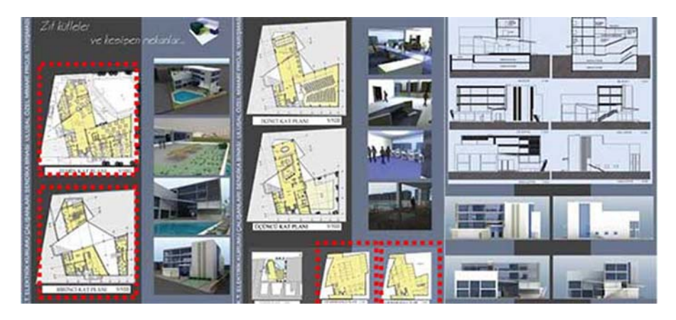
Figure 2. Sample of the G4 (Archive of contestant architects, 2008).

accurate information. They have been grouped under the same problem heading because of the equivalence of their nature despite their contrary names.