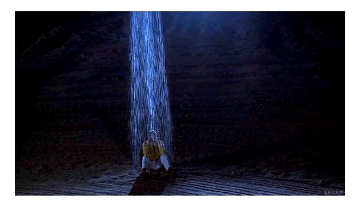
Figure 10: Rain falls only on Truman