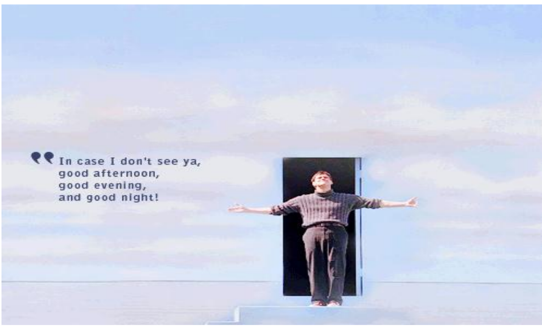
Figure 15: Truman's final message to Christof