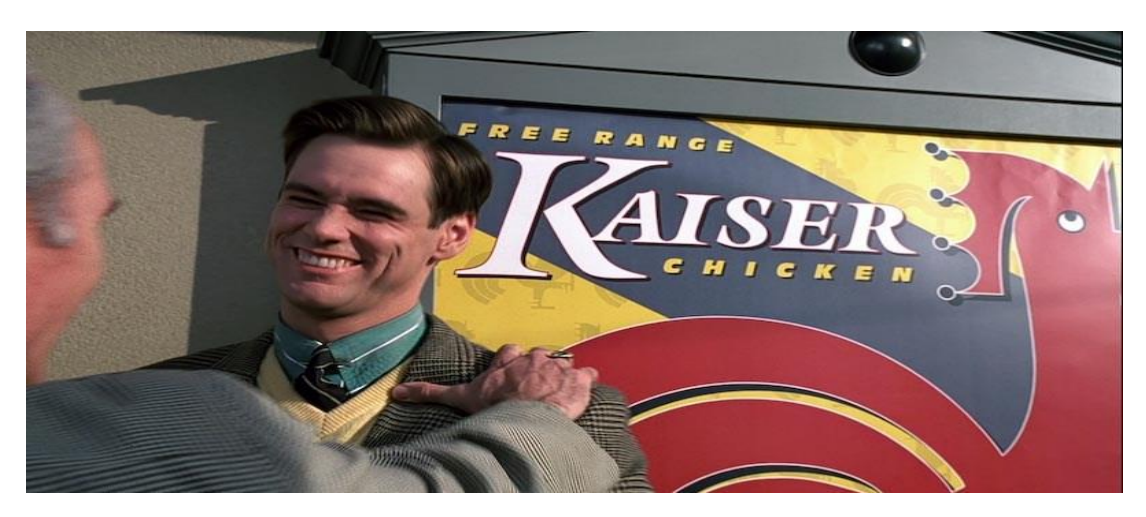
Figure 5: Truman advertising the product