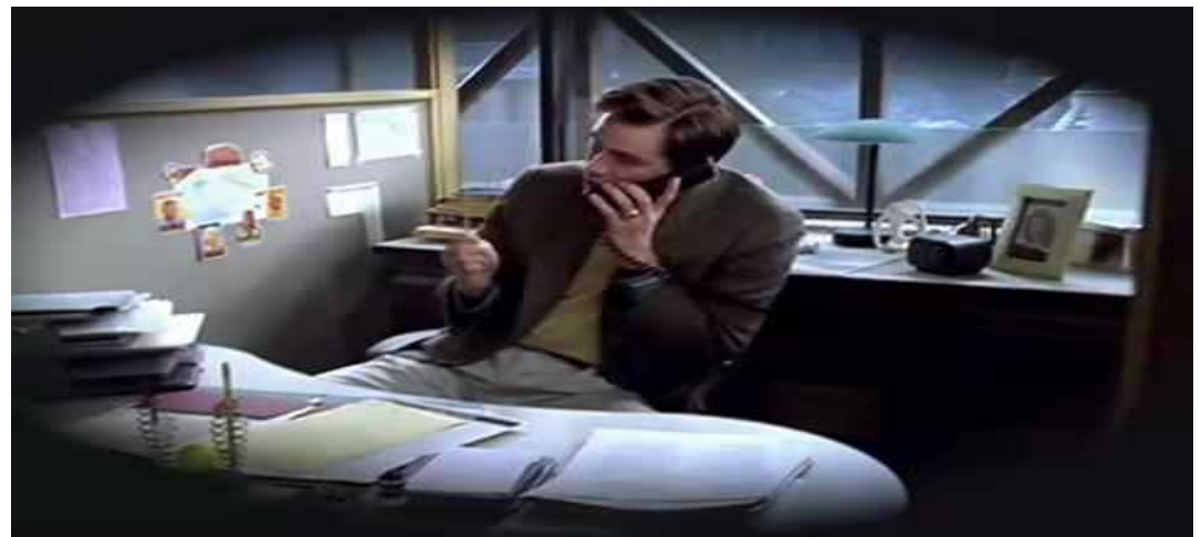
Figure 12: The Illuminati Sign represented in The Truman Show