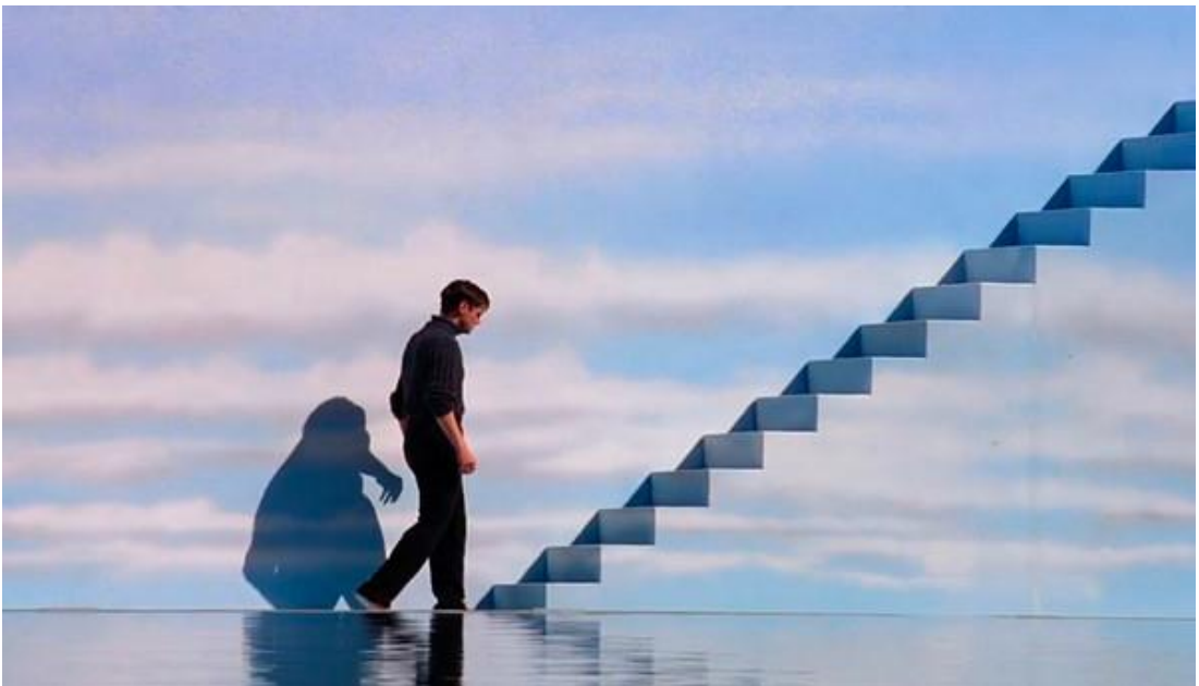
Figure 14: Truman walking up the stairs to "exit"