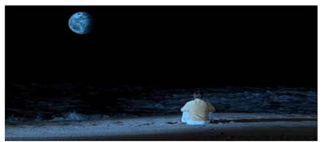
Figure 3: Representation of the moon in The Truman Show

actually Truman. Furthermore, reality is misrepresented, that is, again, there is an ironic construction of the story. In every scene of The Truman Show there is a representation of particular signs each having a unique reference to certain issues. These issues are related to media, the Illuminati, and religious concepts. To illustrate, Truman draws a circle on the mirror which suggests the globe of his own perception, or perhaps it suggests the "stage-set" world in which he is imprisoned. There is a continuous "product placement" in the scenes particularly performed by his wife Meryl. For example, it is very obvious when she acts to the camera showing the "Chef's Pal" and speaks in a tone of voice trying to highlight the product. The KAISER chicken advertisement appears when Truman is on the way to work stops and talk to men, at that point the camera angles point to the poster on the wall trying to draw attention to the advertisement for KAISER chicken (see Appendix A).