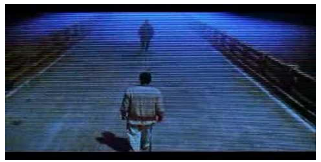
Figure 1:Truman meeting his father