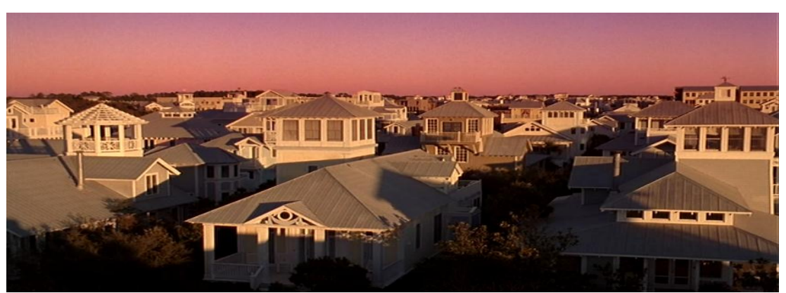
Figure 13: Sunrise in Seahaven representing enlightenment