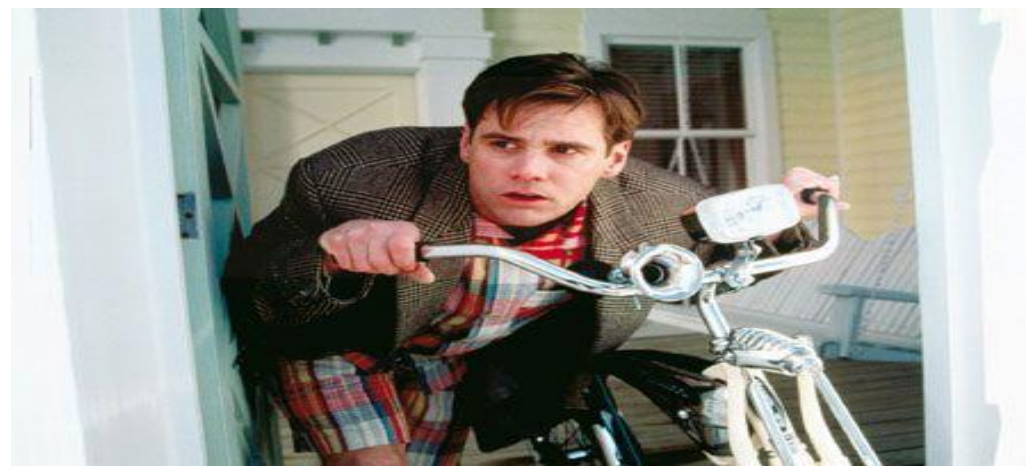
Figure 2: Truman is suspicious and is determined to find the truth

and find the truth. In this case, the curiosity and suspicion of Truman grows into anger and frustration and generates rebellion (Fazlon, 2011).