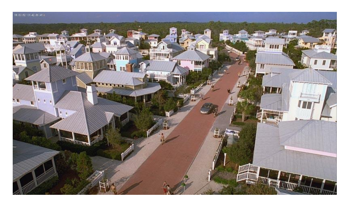
Figure 8: Seahaven