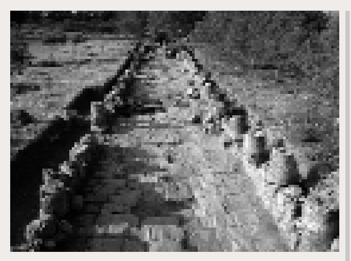
Running parallel and immediately adjacent to the bath complex is a column lined Roman road.

The course of the road is North-South, and is marked by a series of fragmentary Doric columns protruding from the current surface level. These columns were utilized in the initial test trenching of 2002, from which the current excavations originated. GPS has since been employed in estimations as to the exact orientation of the road. These projections have since been supplemented with further test trenching and excavation. Thus the structure of the road, 340 meters of which have been uncovered, can be traced from the public buildings in the North, to a residential area in the South. Conclusive evidence for the existence of the road ends at the late city walls, in the South, beyond which excavations have not yet been done. The North boundary is composed of a gate structure and a perpendicular road connecting the Roman bath complex with the theater. Evidence exists to suggest that either the road, or another architectural feature, extends beyond this area. Excavations to support this conclusion are pending completion.