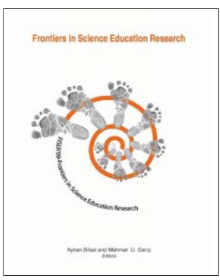
Proceedings of FISER09

ent countries. Participants also had the chance to be exposed to the