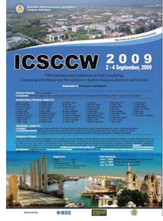
Image and Video Processing; Image and Signal Compression; Image Forensics and Security; and Pattern Recognition are among the listed topics of the conference. The conference will be held between 2 - 4 September 2009 at Salamis Bay Conti Hotel, Famagusta. The deadline for manuscript submission is 1 June 2009. Further information on ICSCCW 2009 could be obtained via http://www.ee.emu.edu.tr/icsc-cw2009.

Telecommunications; Signal Processing; High Performance Computing; Audio,