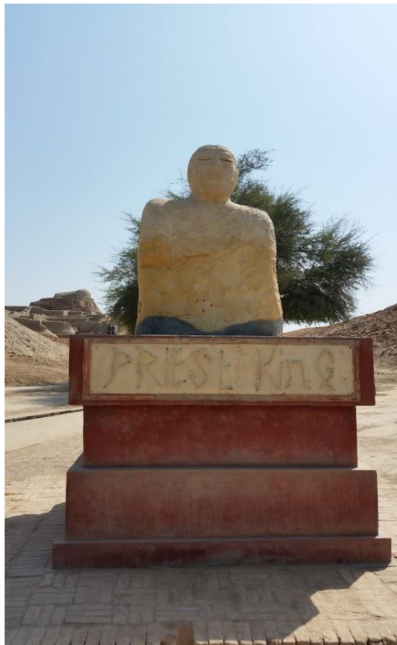
Figure 3: King Priest of Mohenjo Daro (one of most significant findings of all time)

emphasizes community participation, and responsible tourist behavior. This research emphasizes the necessity of bringing together people to understand culture, identify risks, and encourage sustainable tourism. However, previous studies have shown that local community participation in decision-making processes promotes ownership and active conservation.