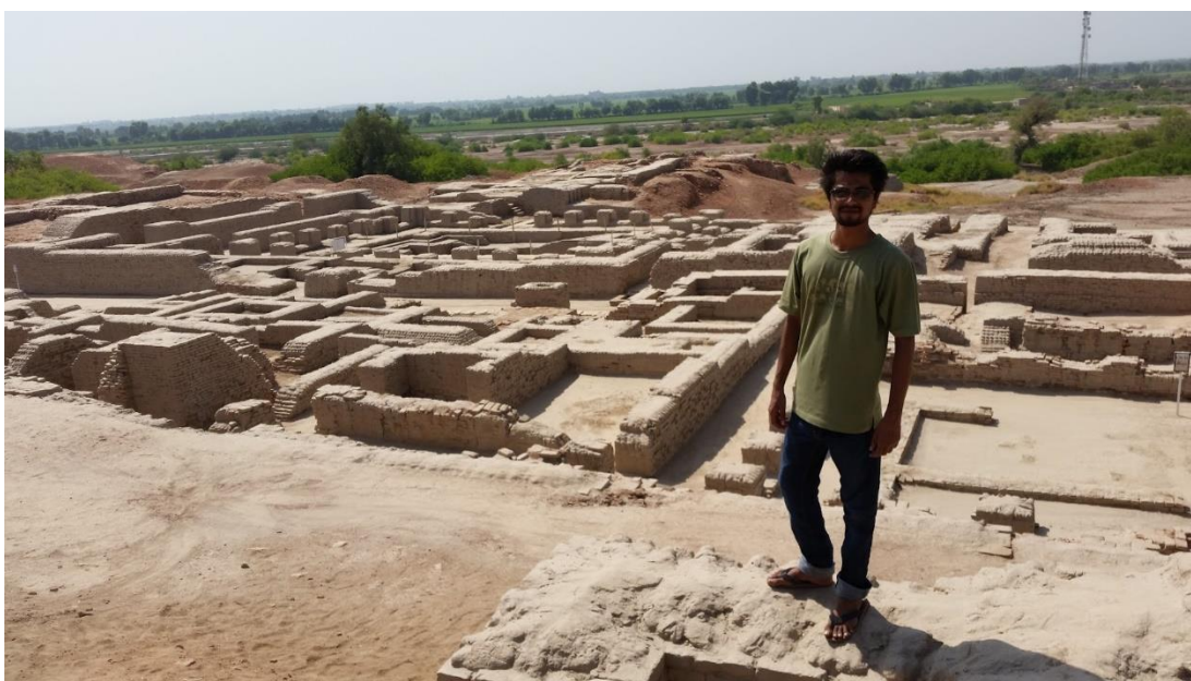
Figure 1: Me at the Mohenjo Daro ruins