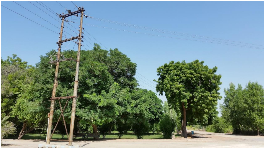
Figure 2: Greenery around the Mohenjo Daro site

This study has provided a comprehensive analysis of the challenges and opportunities associated with the preservation of Mohenjo Daro. Government officials, experts, local community members, tourists, and service providers, NGOs' representatives contributed participation for the study. The findings of the research address sustainability, conservation, and community participation at Mohenjo Daro. This study aims to preserve the Mohenjo Daro UNESCO World Heritage Site, which has significant importance in history, archeology, and culture. The research analyzed its conservation advantages and disadvantages.